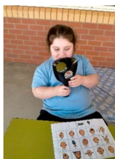
Gabby investigating emotions.