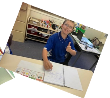
Room 18 Art